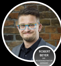
ROBERT BEYER EISENMANUFATUR GERMANY